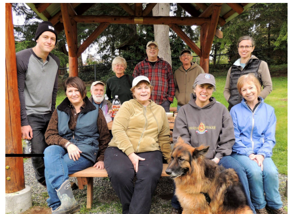
Volunteers at April work party